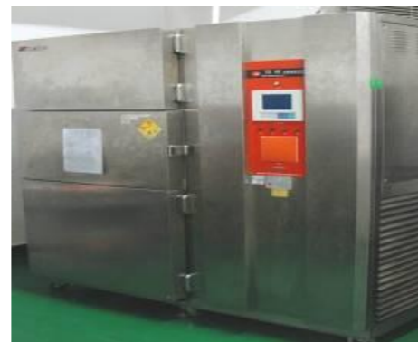
Thermal Shock Tester