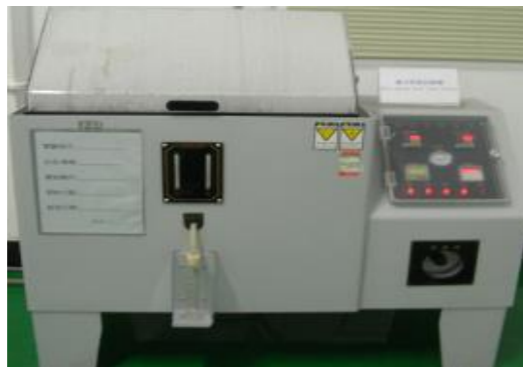
Salt Spray Test Machine