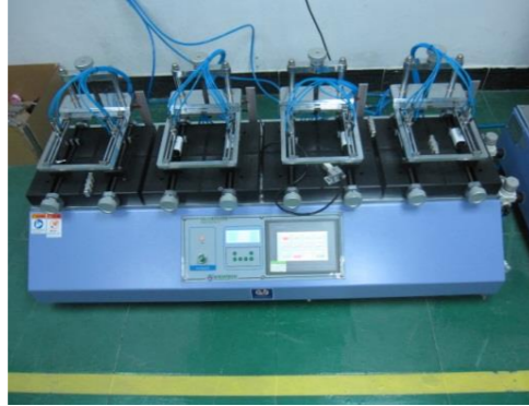
Button Life Tester